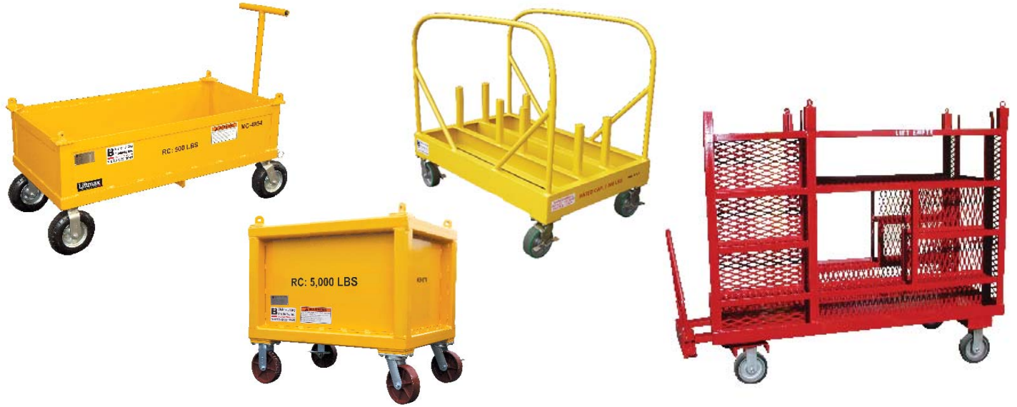
Model: MC - Liftmax® Material Carts